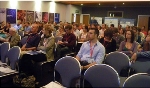
The morning after the night before – an impressive turnout.