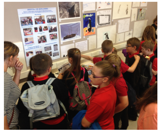
The children also judged the polar photo prize and took part in an art competition.