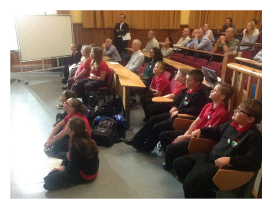
Students look younger and younger these days: school children from a local primary school enjoy the outreach activities associated with the meeting.