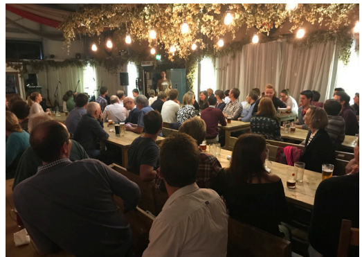
The banquet was held at the Brewery.

five years, with a huge number of Aberdeen BBM (2012) early-career attendees now in full employment or in postdoctoral positions. Socializing and discussions continued late into the evening in Lancaster city centre.