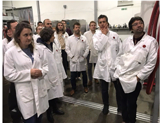
Delegates listen attentively to a talk about the Lancaster Brewery during a tour of their facilities before the conference dinner.