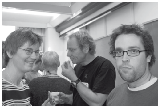
Fig. 4a The NWG meeting attracts a lot of interesting people....

negligible component of eustatic sea level rise. Obviously, all components have to be monitored and studied closely. As an example, Menounos presented work from co-author Berthier showing large changes in Alaska and neighboring Canada by analyzing digital elevation models produced from satellite imagery. Garry Clarke spoiled our picture of white landscapes and reminded us that glaciers are often quite dirty, which has a profound effect on their mass balance. He showed some ideas on how to incorporate this into glacier models. The topic then shifted rather abruptly to microbiology and Lanoil showed some evidence for life in subglacial environments. The morning was rounded out by a presentation from Miles. He does environmental consulting and showed many examples of changes in stream flow and sediment discharge caused by glacier change. It was a nice reminder that the most immediate effect of glacier change is usually not sea level rise, but the geomorphological and hydrological changes in glaciated basins.