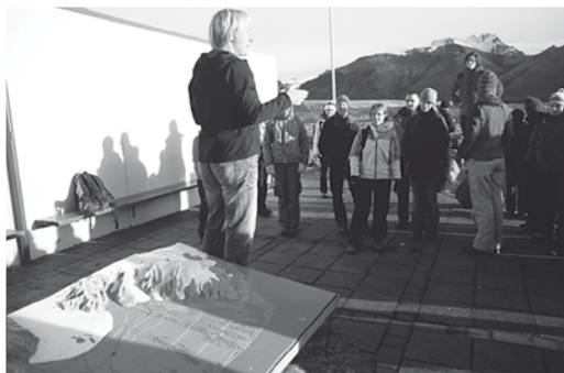
Fig. 3 National Park Superintendent Regína Hreinsdóttir lectures about Skaftafell National Park to meeting participants. Model of the vicinity in the foreground and Öræfajökull central volcano and glacier in the background.

Már, in the old days people on farms around the village even had in their contract that they did not have to eat lobster more than six days a week!).