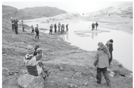
Fig. 2 Meeting participants at the margin of Hoffellsjökull. The glacier has retreated in recent years forming a new lake at the terminus.