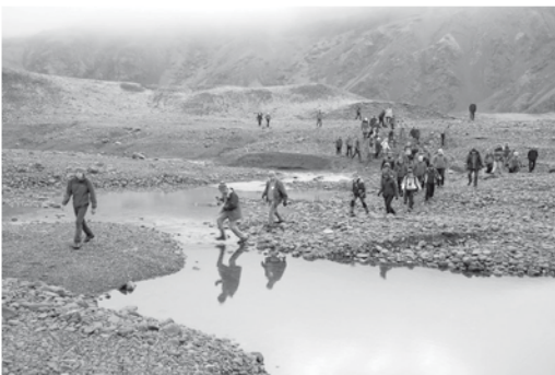
Fig. 1 En-route to the new lake in front of Hoffellsjökull, an outlet glacier from Vatnajökull ice cap near Höfn.