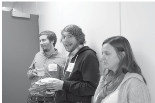
Fig. 2 Those University of Washington students are all the same – they can never be serious whether in or out of class.

even her own student would adhere to the new recommendations.