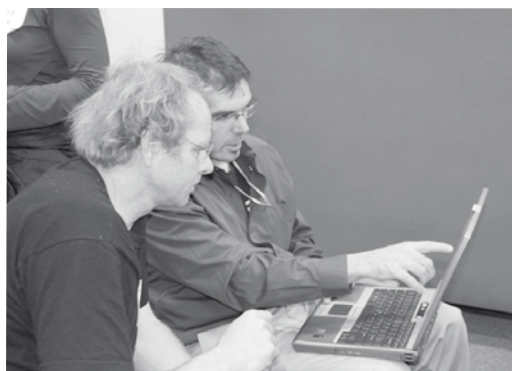
Fig. 6 The meeting is an excellent opportunity to sit down to some face to face (computer) discussions.