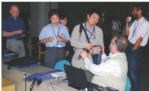
Fig. 13. This tie will really make you look like a glaciologist...

Besides the great hospitality of the city of Sapporo, the flavorful food and the comfortable hotels and ryokan , attendees of the symposium were treated to a special suite of excursions during the mid-week break and to a delightful Japanese barbeque at the Sapporo Beer Garden. Among the highlights of the mid-week excursions were visits to beautiful outdoor sculpture displays, instructions in the art and science of making sushi and brewing sake , and a visit to a facility that used snow as a means of reducing summer air conditioning costs. For the most intrepid attendees, a visit to a traditional Japanese onsen (hot spring bath) was arranged, along with extensive instruction in both the etiquette and techniques for enjoying a truly Japanese experience in a most (ahem) 'stripped down' manner. It is unlikely that any previous IGS symposium offered attendees such an intimate and personal view of their colleagues as was enjoyed in the steamy hot waters surrounded by the beautiful natural terrain of Hokkaido. The evening at the Sapporo Beer Garden was notable not only for the relatively robust consumption of