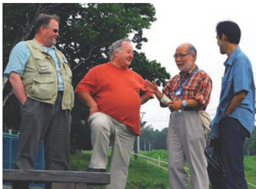
Fig. 11. Differences between the Western and Eastern diet

Besides the great hospitality of the city of Sapporo, the flavorful food and the comfortable hotels and ryokan , attendees of the symposium were treated to a special suite of excursions during the mid-week break and to a delightful Japanese barbeque at the Sapporo Beer Garden. Among the highlights of the mid-week excursions were visits to beautiful outdoor sculpture displays, instructions in the art and science of making sushi and brewing sake , and a visit to a facility that used snow as a means of reducing summer air conditioning costs. For the most intrepid attendees, a visit to a traditional Japanese onsen (hot spring bath) was arranged, along with extensive instruction in both the etiquette and techniques for enjoying a truly Japanese experience in a most (ahem) 'stripped down' manner. It is unlikely that any previous IGS symposium offered attendees such an intimate and personal view of their colleagues as was enjoyed in the steamy hot waters surrounded by the beautiful natural terrain of Hokkaido. The evening at the Sapporo Beer Garden was notable not only for the relatively robust consumption of