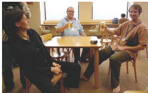
Fig. 10. The best part of the onsen experience is cooling off at the end....

snow and ice research. Of particular note was the fact that this symposium combined several sub-communities of glaciological scientists, bringing together those who specialize in snow and avalanche research with those who specialize in glaciers and ice sheets. New frontiers of glaciological research were emphasized in several of the oral and poster sessions, including: the state of Himalayan glaciers, mass-balance trends of glaciers in Asia, proglacial lake outburst floods and their impact on humans, avalanche hazard mapping, and forecasting of snow and ice systems ranging from avalanches to ice-sheet sea level contributions. One of the special highlights of the symposium was an hour-long address given by former President of the IGS Professor Atsumu Ohmura on the state of the cryosphere in a changing climate.