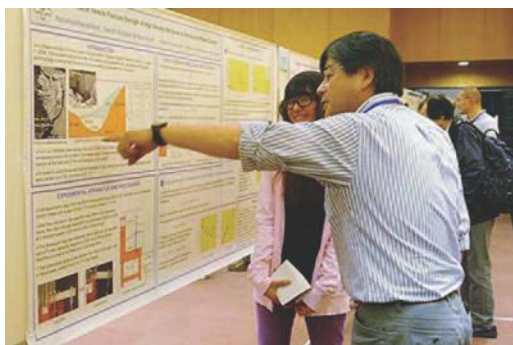
Fig. 7. Snow and Ice scientists, young and old, gather for spirited discussion at the poster session....