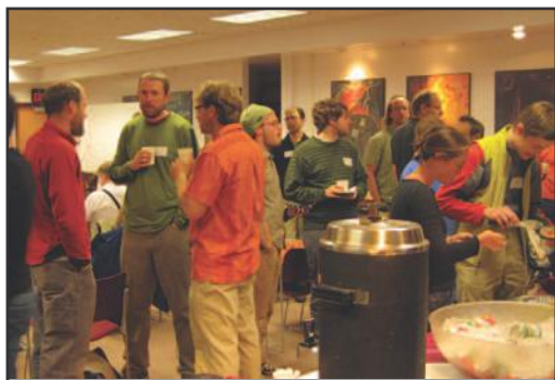
Fig. 1. Snacks, coffee, and conversation make for another productive Northwest Glaciologists' Meeting, hosted by the University of Alaska, Fairbanks.