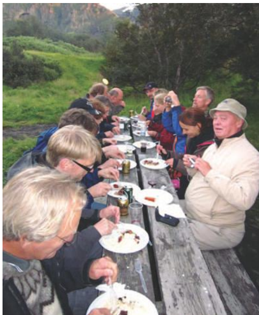
Fig. 3. The splendid barbecue was fully appreciated by all.

Finally, the international part of the symposium ended with a wonderful field trip. Two coaches, with large wheels for fording streams, set out on a beautiful sunny day in the direction of Thorsmörk. There was a brief interlude as one of the coaches disgorged its entire stock of engine oil on to the road in a couple of minutes; however, no one was to be deterred, and another coach appeared and took us onwards. An afternoon refreshment stop was held under the now calm volcano and glacier of Eyjafjallajökull, and the excitement of crossing