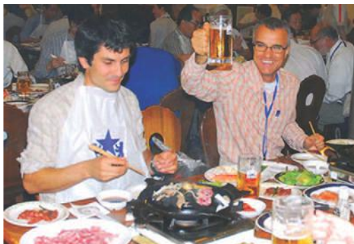
Fig. 15. All you can cook barbeque, Japanese style...