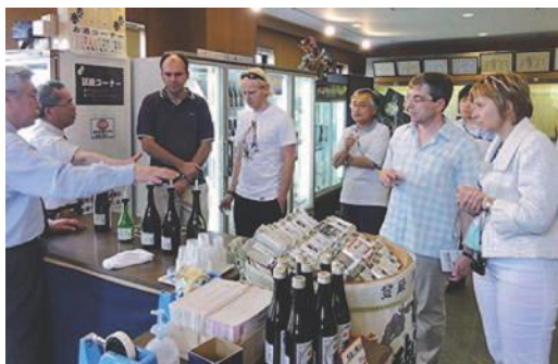
Fig. 12. One must be very thoughtful about important choices...

A highlight of the week was the award of the Richardson Medal of the IGS to a most deserving