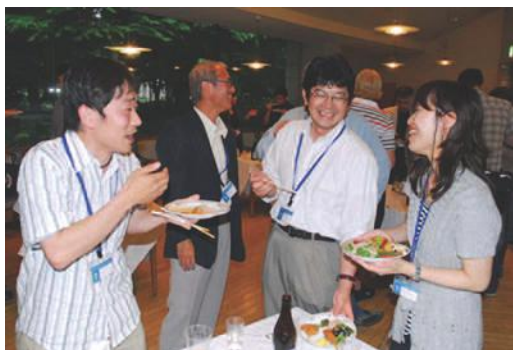
Fig. 3. Kampai!

The symposium was held on the picturesque campus of Hokkaido University, the second oldest (founded in 1918) of the magnificent seven , the National Seven Universities ( zenkoku shichidaigaku ) of Japan. This venerable university