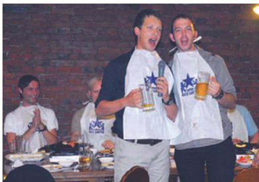
Fig. 14. Sapporo's got talent!

one of Japan's most favored beverages but also for the unique way in which food was presented and prepared. Each table was presented with unending platters of lamb, fish and vegetables à la Genghis Khan, and guests cooked their own meals over a small cast iron stove or shichirin .