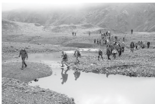
Fig. 1 En-route to the new lake in front of Hoffellsjökull, an outlet glacier from Vatnajökull ice cap near Höfn.