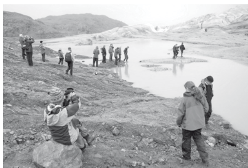
Fig. 2 Meeting participants at the margin of Hoffellsjökull. The glacier has retreated in recent years forming a new lake at the terminus.