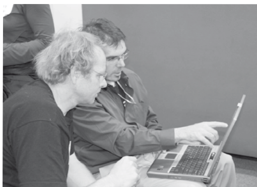
Fig. 6 The meeting is an excellent opportunity to sit down to some face to face (computer) discussions.