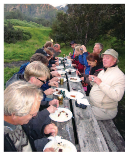
Fig. 3. The splendid barbecue was fully appreciated by all.

Finally, the international part of the symposium ended with a wonderful field trip. Two coaches, with large wheels for fording streams, set out on a beautiful sunny day in the direction of Thorsmörk. There was a brief interlude as one of the coaches disgorged its entire stock of engine oil on to the road in a couple of minutes; however, no one was to be deterred, and another coach appeared and took us onwards. An afternoon refreshment stop was held under the now calm volcano and glacier of Eyjafjallajökull, and the excitement of crossing