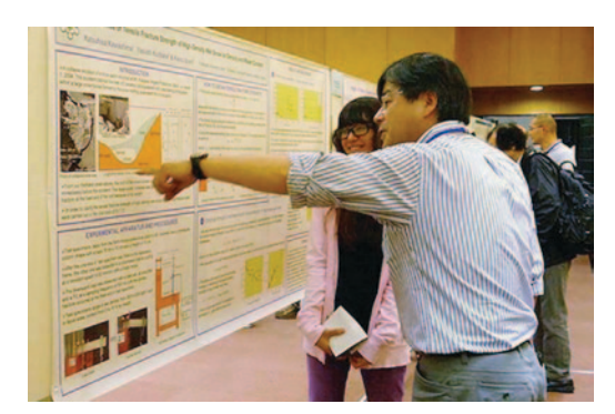
Fig. 7. Snow and Ice scientists, young and old, gather for spirited discussion at the poster session....