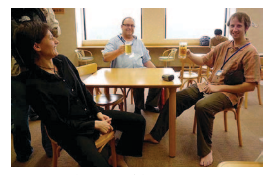
Fig. 10. The best part of the onsen experience is cooling off at the end....

snow and ice research. Of particular note was the fact that this symposium combined several sub-communities of glaciological scientists, bringing together those who specialize in snow and avalanche research with those who specialize in glaciers and ice sheets. New frontiers of glaciological research were emphasized in several of the oral and poster sessions, including: the state of Himalayan glaciers, mass-balance trends of glaciers in Asia, proglacial lake outburst floods and their impact on humans, avalanche hazard mapping, and forecasting of snow and ice systems ranging from avalanches to ice-sheet sea level contributions. One of the special highlights of the symposium was an hour-long address given by former President of the IGS Professor Atsumu Ohmura on the state of the cryosphere in a changing climate.