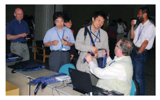
Fig. 13. This tie will really make you look like a glaciologist...