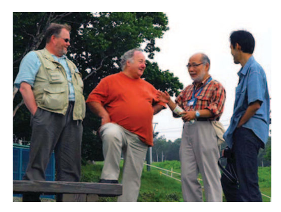
Fig. 11. Differences between the Western and Eastern diet

Besides the great hospitality of the city of Sapporo, the flavorful food and the comfortable hotels and ryokan, attendees of the symposium were treated to a special suite of excursions during the mid-week break and to a delightful Japanese barbeque at the Sapporo Beer Garden. Among the highlights of the mid-week excursions were visits to beautiful outdoor sculpture displays, instructions in the art and science of making sushi and brewing sake, and a visit to a facility that used snow as a means of reducing summer air conditioning costs. For the most intrepid attendees, a visit to a traditional Japanese onsen (hot spring bath) was arranged, along with extensive instruction in both the etiquette and techniques for enjoying a truly Japanese experience in a most (ahem) 'stripped down' manner. It is unlikely that any previous IGS symposium offered attendees such an intimate and personal view of their colleagues as was enjoyed in the steamy hot waters surrounded by the beautiful natural terrain of Hokkaido. The evening at the Sapporo Beer Garden was notable not only for the relatively robust consumption of